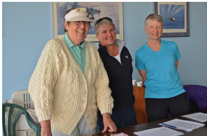
These lovely ladies handled the registration of 44 kids